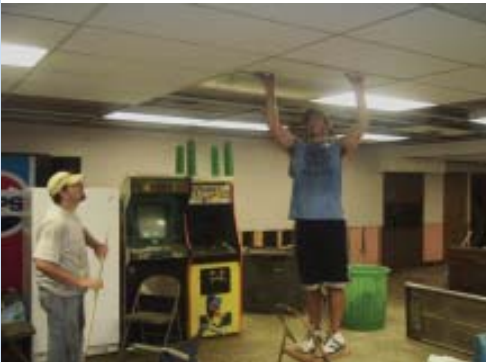
Above: Two of the mission team are shown renewing the ceiling in the church basement.

More than 55 volunteers from five churches in the Pioneer Baptist Association took their love for Jesus to Pittsburgh on the annual association mission trip July 23-30. This year marked the sixth year Pioneer Association members have gone on a mission trip together. Previous trips included Charleston, SC, Niagra Falls, Wilkes Barre, PA and Cleveland (twice). In Pittsburgh, the team stayed at Lakeside Baptist and worked primarily with two new works — Hope Chapel and Inner City