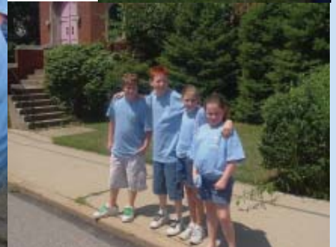
Above: These four children were important team members on the Pioneer mission trip.